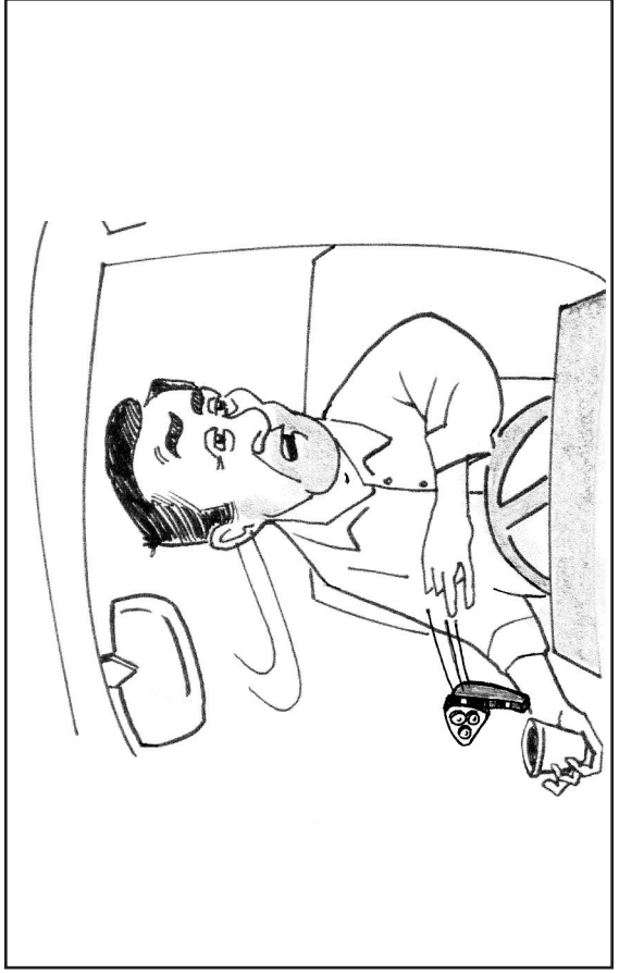
The Bad Driver Picture D