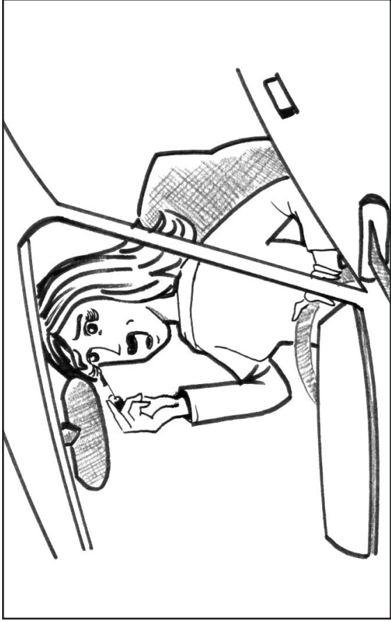
The Bad Driver Picture B